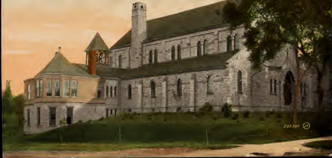
Episcopal Church. Sioux Falls, S D